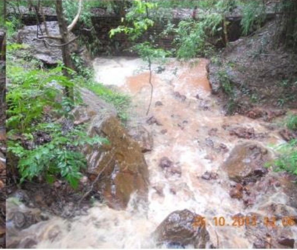
Water arrested During Recent Rain