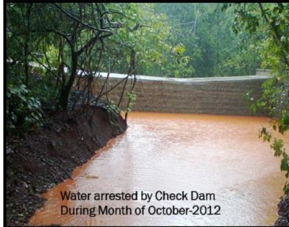
Water arrested by Check Dam During Month of October-2012