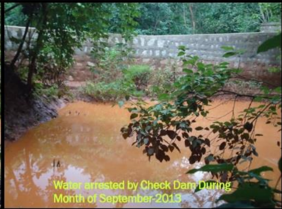
Water arrested by Check Dam During Month of September-2013